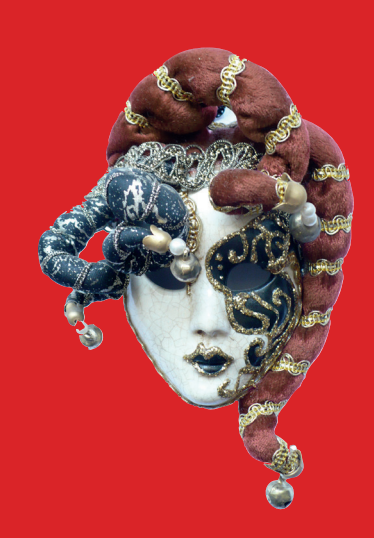
More about this book